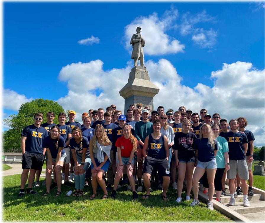
Group photo after Memorial Day Community Service