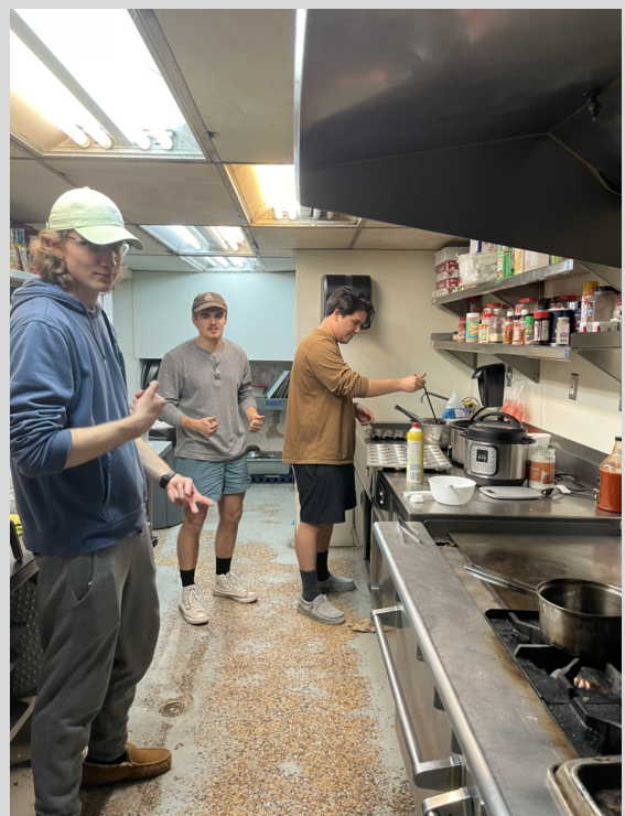
Baking brownies for the Brotherhood