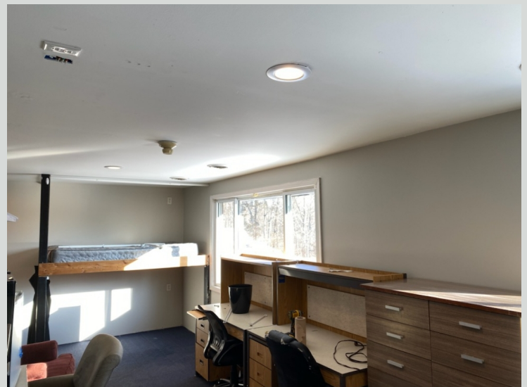
The newly painted TOS