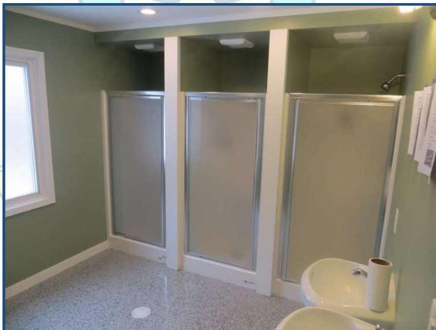
Addition Bathroom Example – renovated 2015

Below you can see an example of the shower units from the 2015 renovation of the addition bathroom. The modern look will be used in the renovation of the OQ bathroom in December.