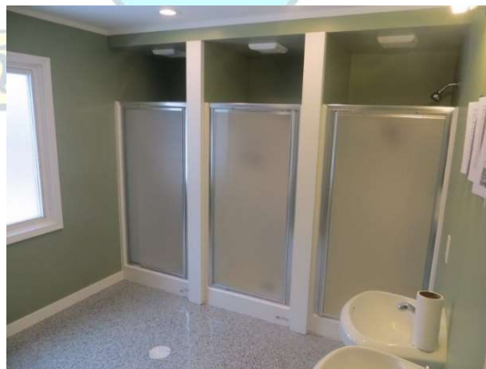
Addition Bathroom Example – renovated 2015

Before that time, we will need to continue and raise funds for this project to ensure that we don't dip into the endowment. We have received quotes for this and the current cost to get the bathroom up to our standards for the brothers will be $14,760, which is less than our original estimate of $25,000. The plan will be to gut everything down to the studs and recondition entire bathroom including three, one-piece shower units like how the addition bathroom was remodeled (see example below). We reprioritized this project during last fall, as we started to get some leaking through one of the shower units. We have temporarily fixed this, but the bathroom is something we need act on a quickly as possible.