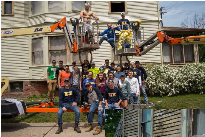
Flint House Painting